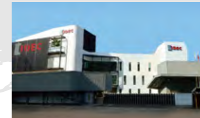
IDEC IZUMI TAIWAN CORPORATION

Sales bases : 21 Distributors : 120 Manufacturing bases : 5 No. of employees : 1,224