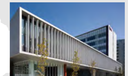
IDEC CORPORATION (Head Office)